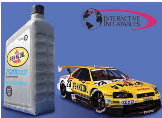
12'H Pennzoil Bottle - Product Replica

Interactive Inflatables can customize any of the products in this catalog, or we can work directly with you to create one-of-a-kind products that are distinctively yours.