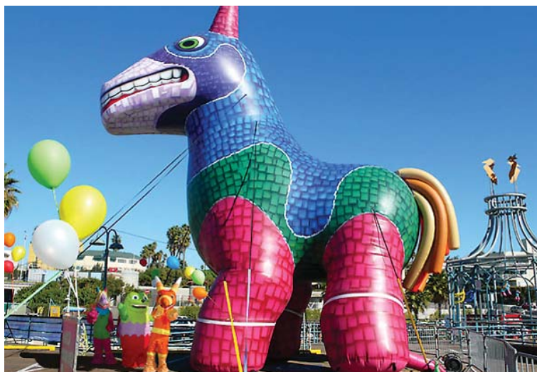
35'H Inflation XBOX VIVA PINATA Game Character