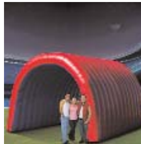
ET10, ET15, ET20

Approximately 150 players per hour. (Dimensions: 15'Lx12'Wx12'H, 250 lbs)