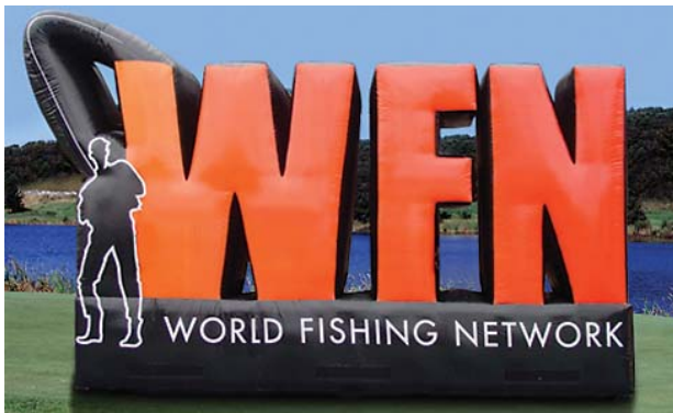
World Fishing Network Inflation Logo Wall

Interactive Inflatables specializes in providing the highest quality custom promotional inflatables manufactured in the USA.