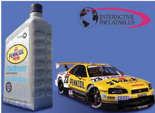
12'H Pennzoil Bottle - Product Replica

Interactive Inflatables can customize any of the products in this catalog, or we can work directly with you to create one-of-a-kind products that are distinctively yours.